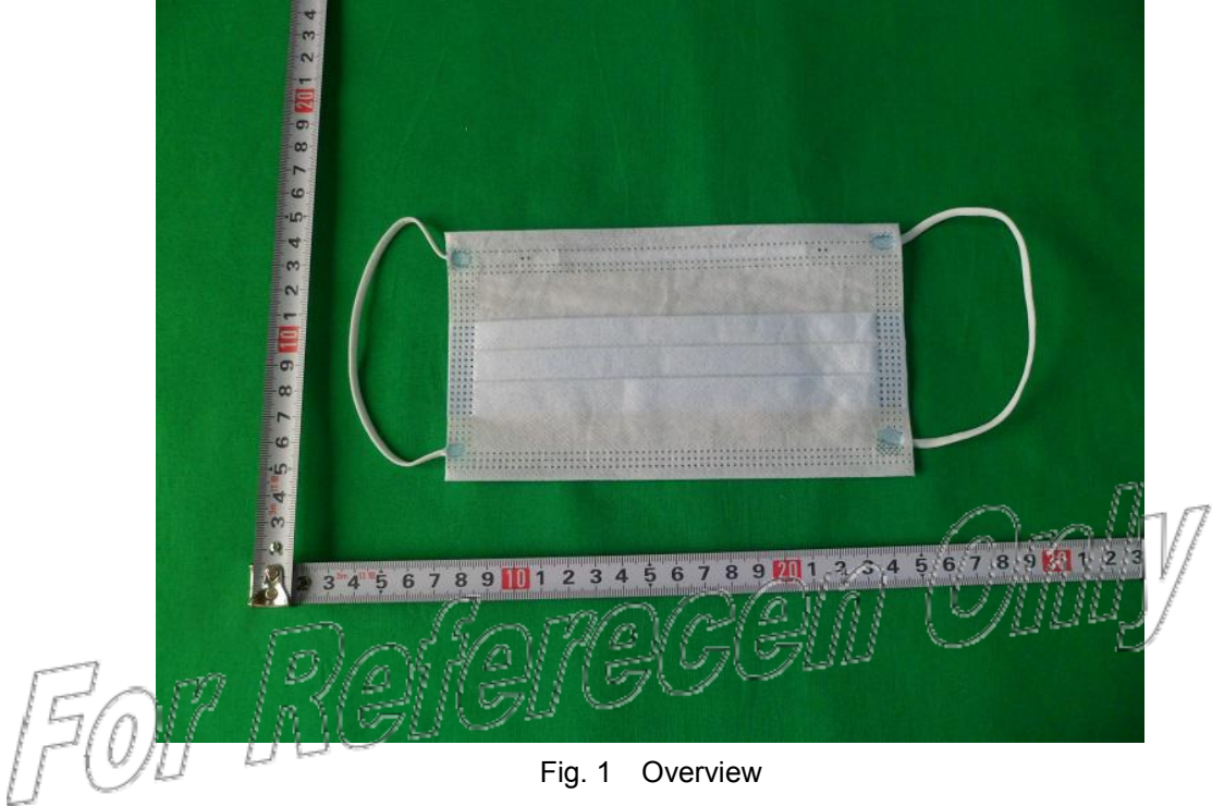
Fig. 1 Overview