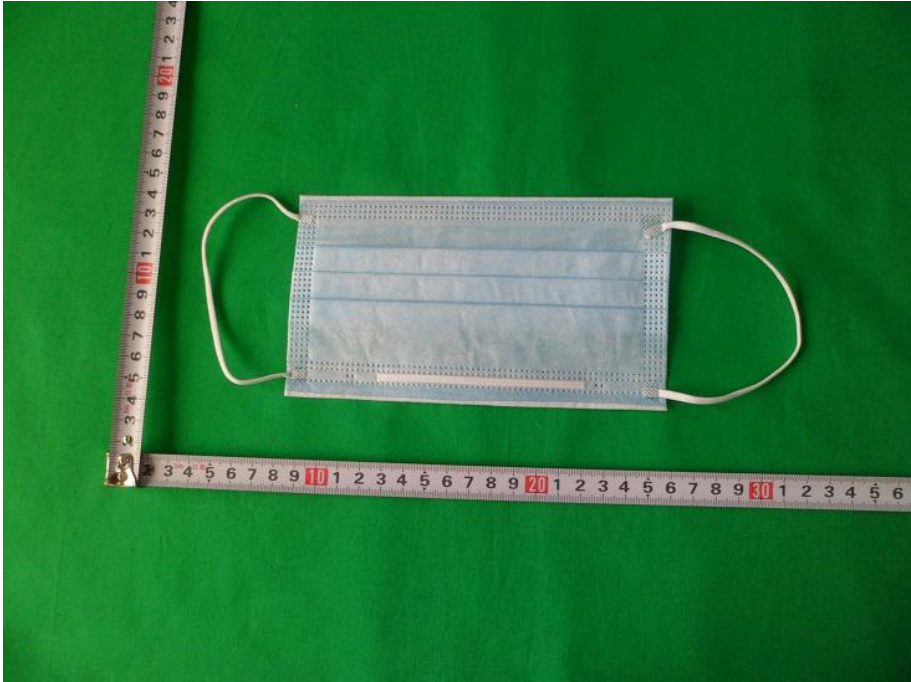
Fig. 2 Overview